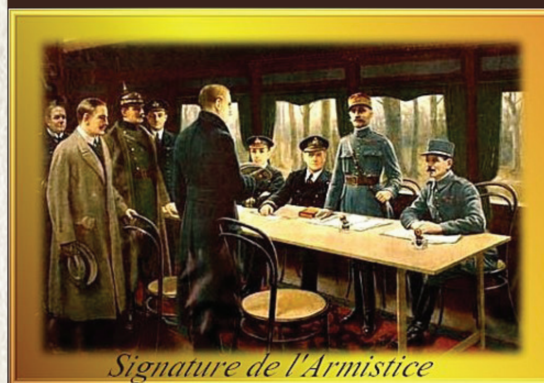
Signature de l'Armistice

NOVEMBER 11TH, 1918: The Great War officially ends with the signing of an armistice