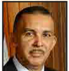
Anthony Thomas Aquinas Carmona 2013 -2018