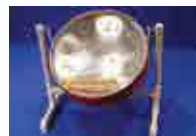
The Steel Pan