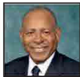
Patrick Manning 1991-1995 2001-2002 2002-2007 2007-2010