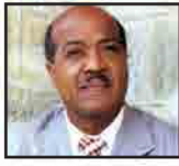
Sir Ellis Clarke 1972-1976