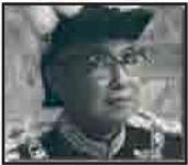
Sir Solomon Hochoy 1962-1972