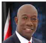
Keith Rowley 2015 – Present