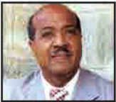
Sir Ellis Clarke 1976 -1987