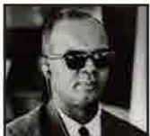
Dr. Eric Williams 1962 -1981