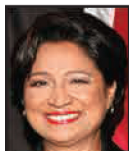
Kamla Persad - Bissessar 2010 - 2015