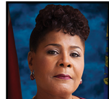
Paula-Mae Weekes 2018 – present